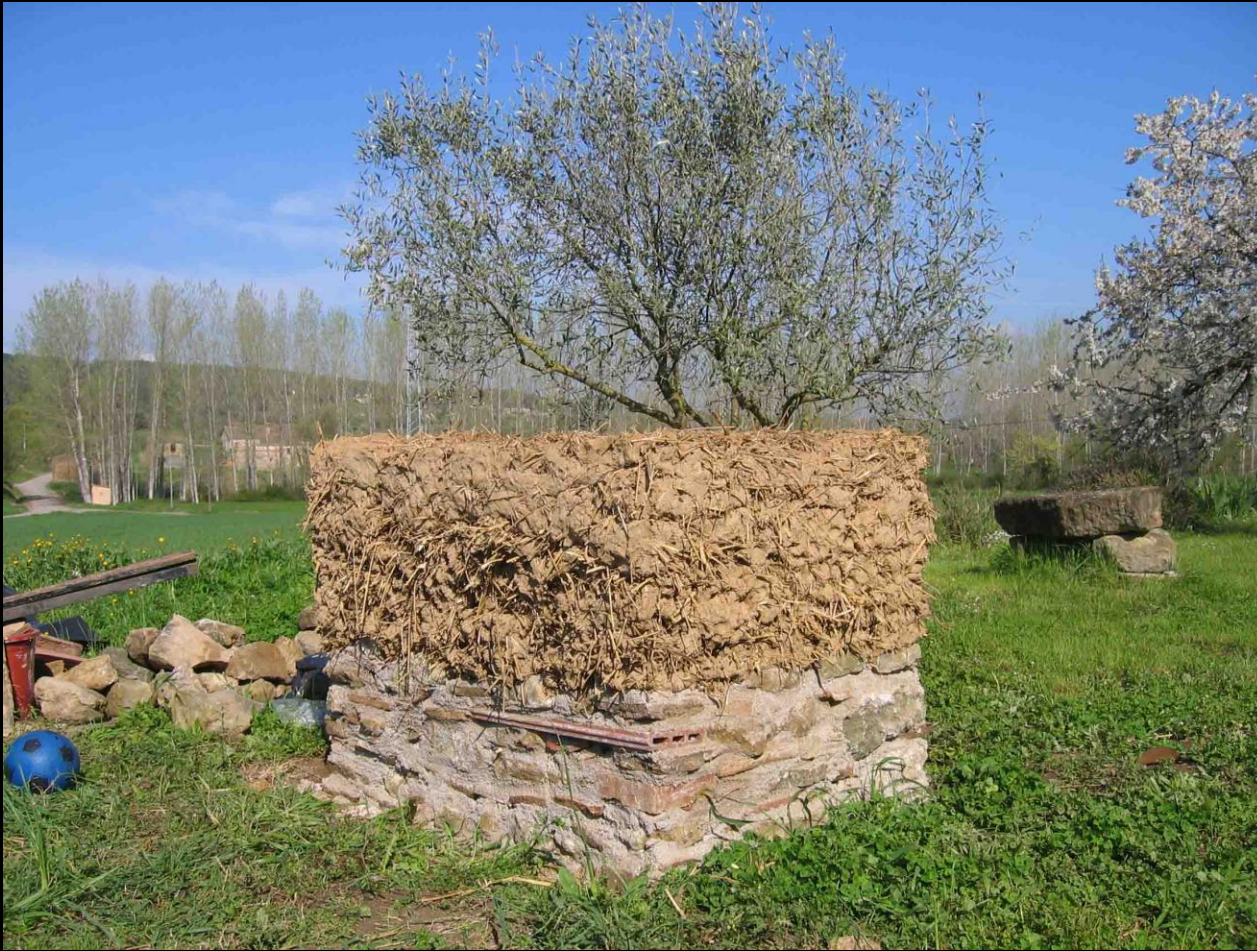
5. The completed base of the oven - 70 x 110 x 80 cm