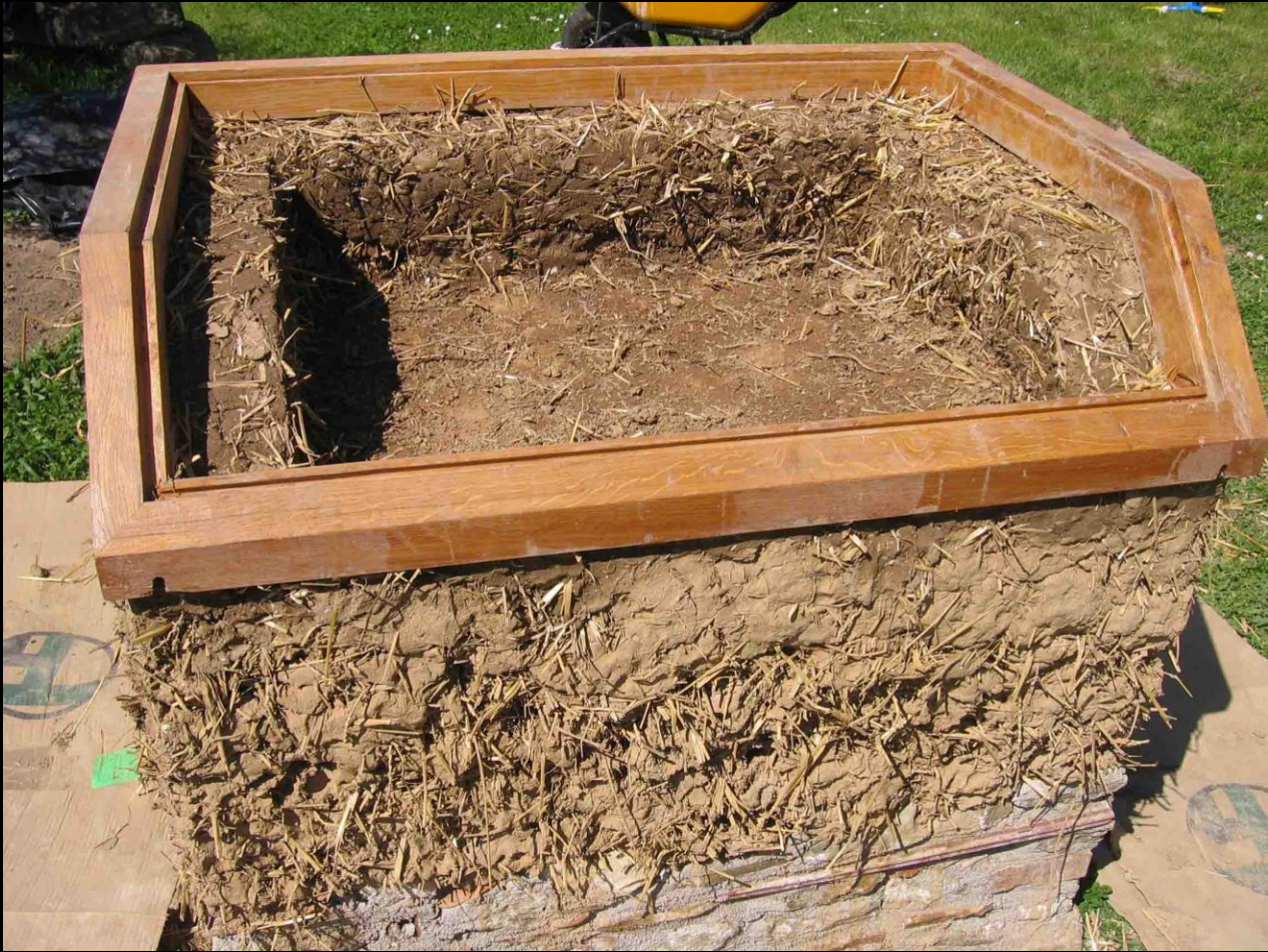
8. The frame installed