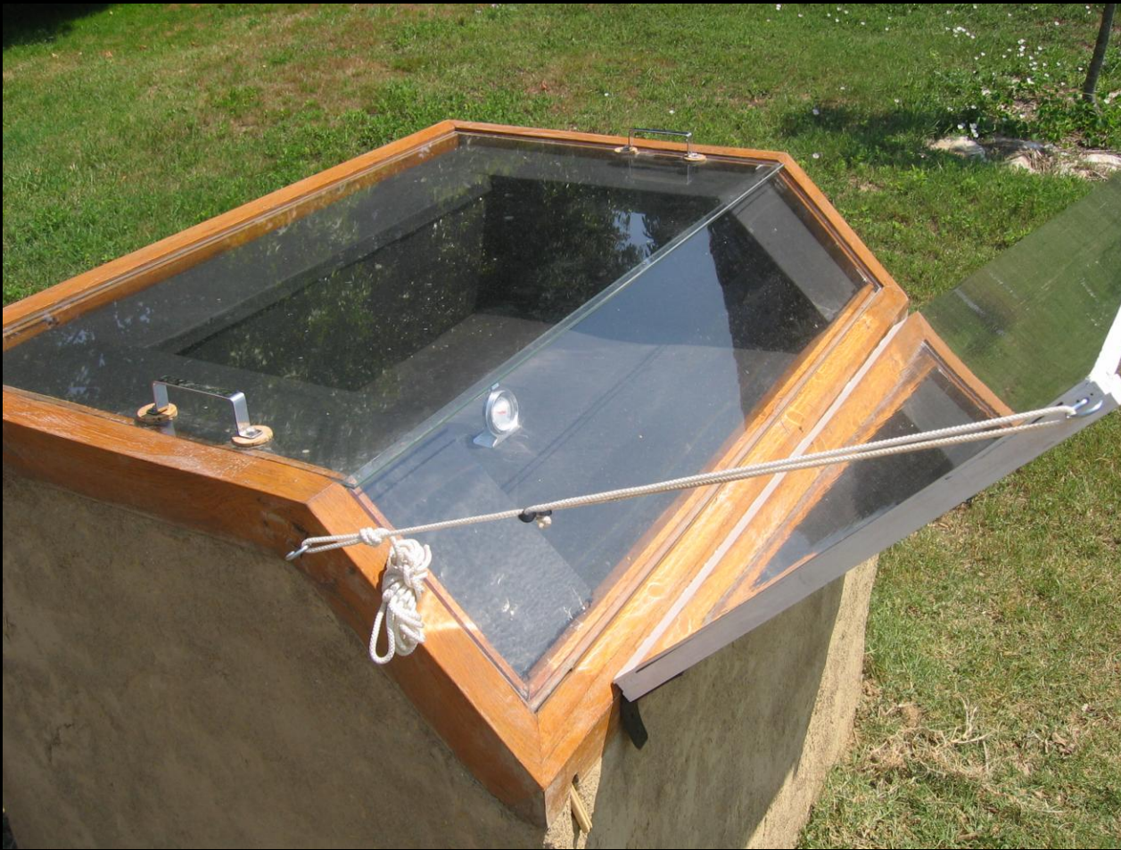
13. View of external reflector with which temperatures reach 120° C.